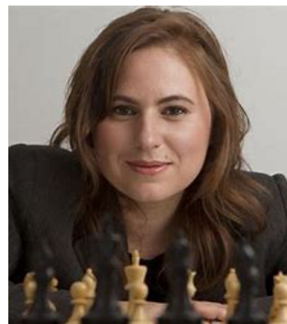
GM Judit Polgar

Among the lecture topics were: Building up an Opening Repertoire (Victor Bologan); Rook Endings and Calculation of variations (Artur Jussopow); Learn from World Champions (Viswanathan Anand); Excelling in chess (Judit Polgar); Positional Play and Attacking Principles (Aagaard); Defense / Isolated Pawns / Hanging Pawns / Central Pawns (Lev Psakhis).