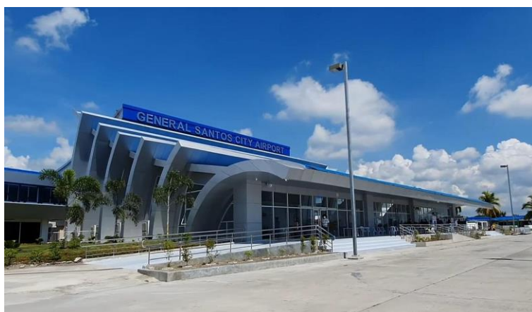
General Santos City International Airport

For foreign nationals, the port of entry for the MPCL Manny Pacquiao International Open Chess Festival is the Ninoy Aquino International Airport (NAIA) which is located in Parañaque City, Metro Manila, Philippines. Then, take another flight from the Ninoy Aquino International Airport (NAIA) to General Santos International Airport. If you take an airplane going to General Santos City from Parañaque City, it takes 2 hours and 30 minutes to arrive. Currently, there are 31 domestic flights to General Santos City weekly. When taking an exit from General Santos City, you have to take a flight vice versa.