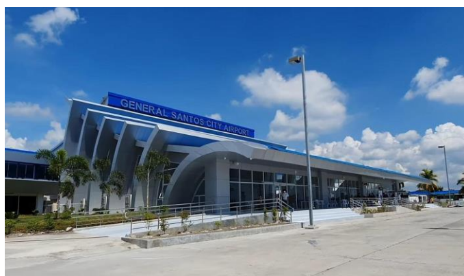
General Santos City International Airport