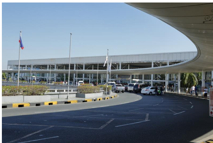
Ninoy Aquino International Airport (NAIA)