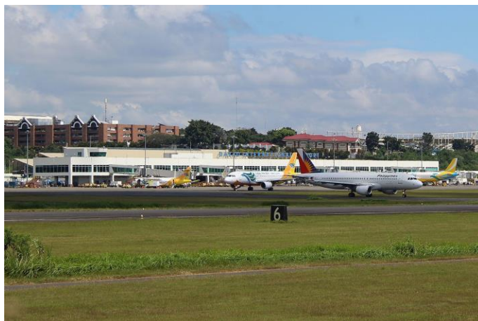
Francisco Bangoy International Airport, Davao City

INVITATION – MPCA INTERNATIONAL OPEN CHESS TOURNAMENT ORGANIZING COMMITTEE @ mpca_eid