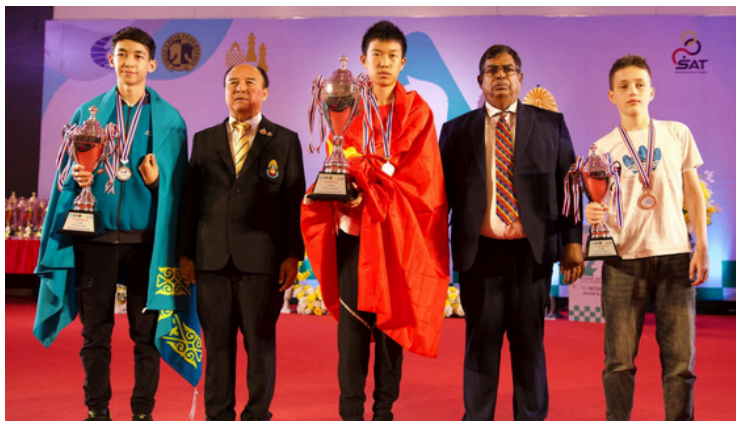
Asian Schools Blitz U15 winners

Visit asianchess.com for more blitz tournament awards photos and results.