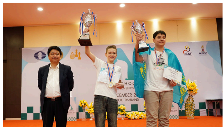
Under 15 rapid championship