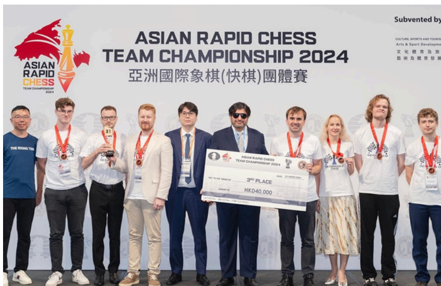
3rd Place: The Formula of Chess of Russia