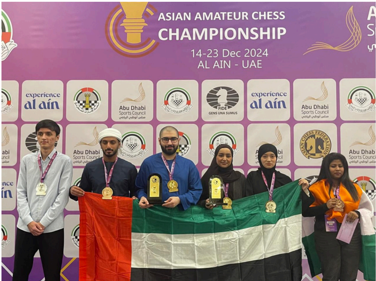
Emirati men and women proudly display their flag as they dominated both divisions of the Asian Amateur Blitz Chess Championship held 19 December 2024 at the Danat Al Ain Resort in Al Ain, United Arab Emirates. Visit asianchess.com