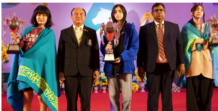
Asian Schools Blitz Girls U15 winners