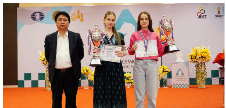
Girls Under 15 rapid championship

Visit asianchess.com for more photos and results of Asian Schools Rapid Chess Championship.