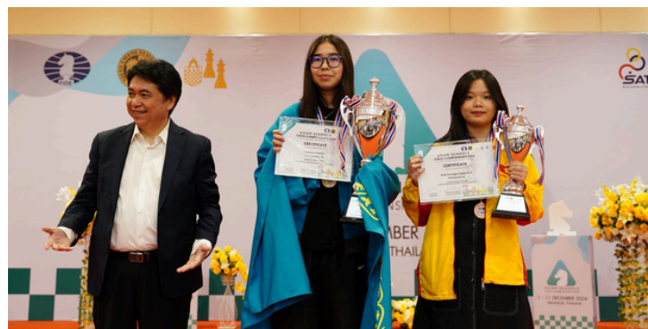
Girls Under 17 rapid championship