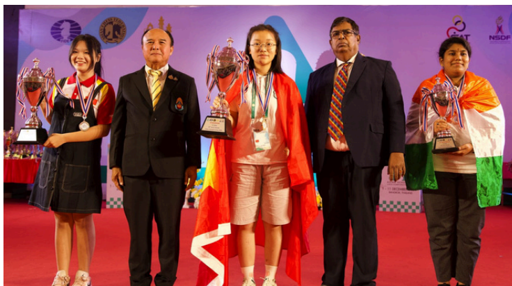
Asian Schools Blitz Girls U17 winners

Visit asianchess.com for more blitz tournament awards photos and results.