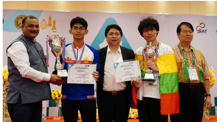
Under 17 rapid championship