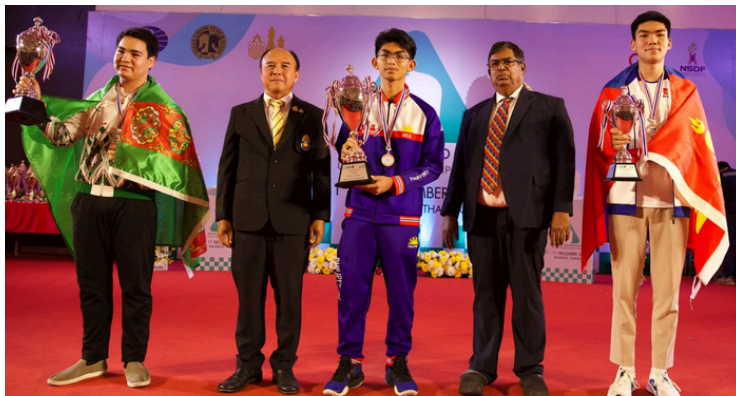
Asian Schools Blitz U17 winners

Kazakhstan, China and Iran topped the Asian Schools Blitz Chess Championship on 10th December 2024 in Bangkok. The event was organized by the Thailand Chess Association under the auspices of FIDE and the Asian Chess Federation.