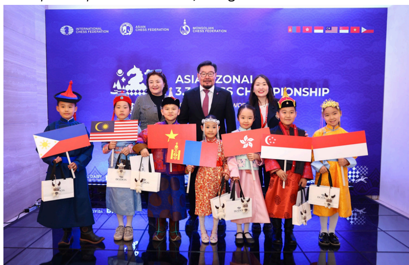
A record number of 109 players from seven countries participated in the Zone 3.3 Zonals. Above, Mongolian Chess Federation officials pose with children at the parade of flags.