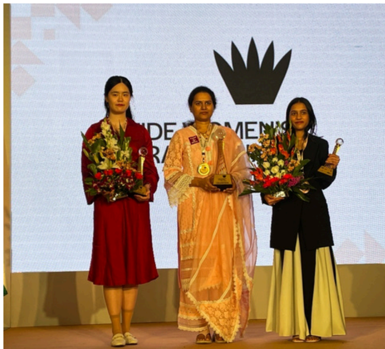
GM Koneru Humpy (center) of India won the FIDE Women's Grand Prix held 13-24 April 2025 in Pune, India. GM Zhu Jiner of China (left) placed second while WGM Divya Deshmukh of India placed third.

After a very stressful afternoon for everyone, Indian number one Humpy Koneru claimed victory in the Pune Women's Grand Prix, edging out Chinese prodigy Zhu Jiner in the tiebreak. Both of them won their final games, totalling seven points apiece. Third place goes to Divya Deshmukh, who drew with Alina Kashlinskaya in their last-round game. Humpy recognized that luck had played a big part in her victory: "I haven't been doing very well lately in classical chess, but here I have recovered my rating points and with the exception of yesterday's game against Kashlinskaya, I think I have played quite well" With these results, Alexandra Goryachkina leads the WGP with 308.34 points (three events played), followed by Humpy Koneru with 279.17 points (three events played) and Zhu Jiner with 235 points (two events played). Anna Muzychuk is just behind with 189.17 points and has also only played two events.