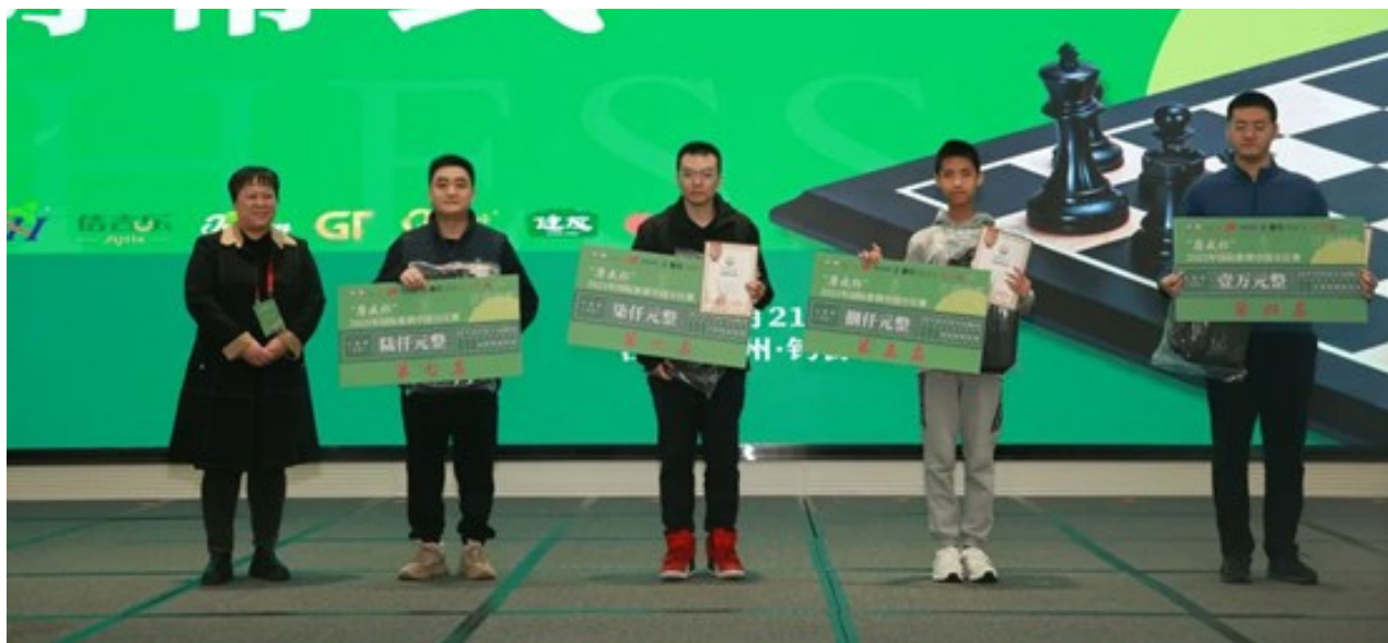
Zonal 3.5 Chess Championship 2025 Men