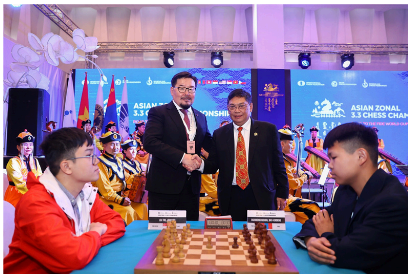
Mongolian Chess Federation president Gombojav Zandanshatar and Zone 3.3 president Senator GM Utut Adianto of Indonesia make the ceremonial moves opening the Zone 3.3 Zonal Chess Championship in Ulaanbaatar, Mongolia.

Congratulations to the Mongolian Chess Federation for a well organized event.