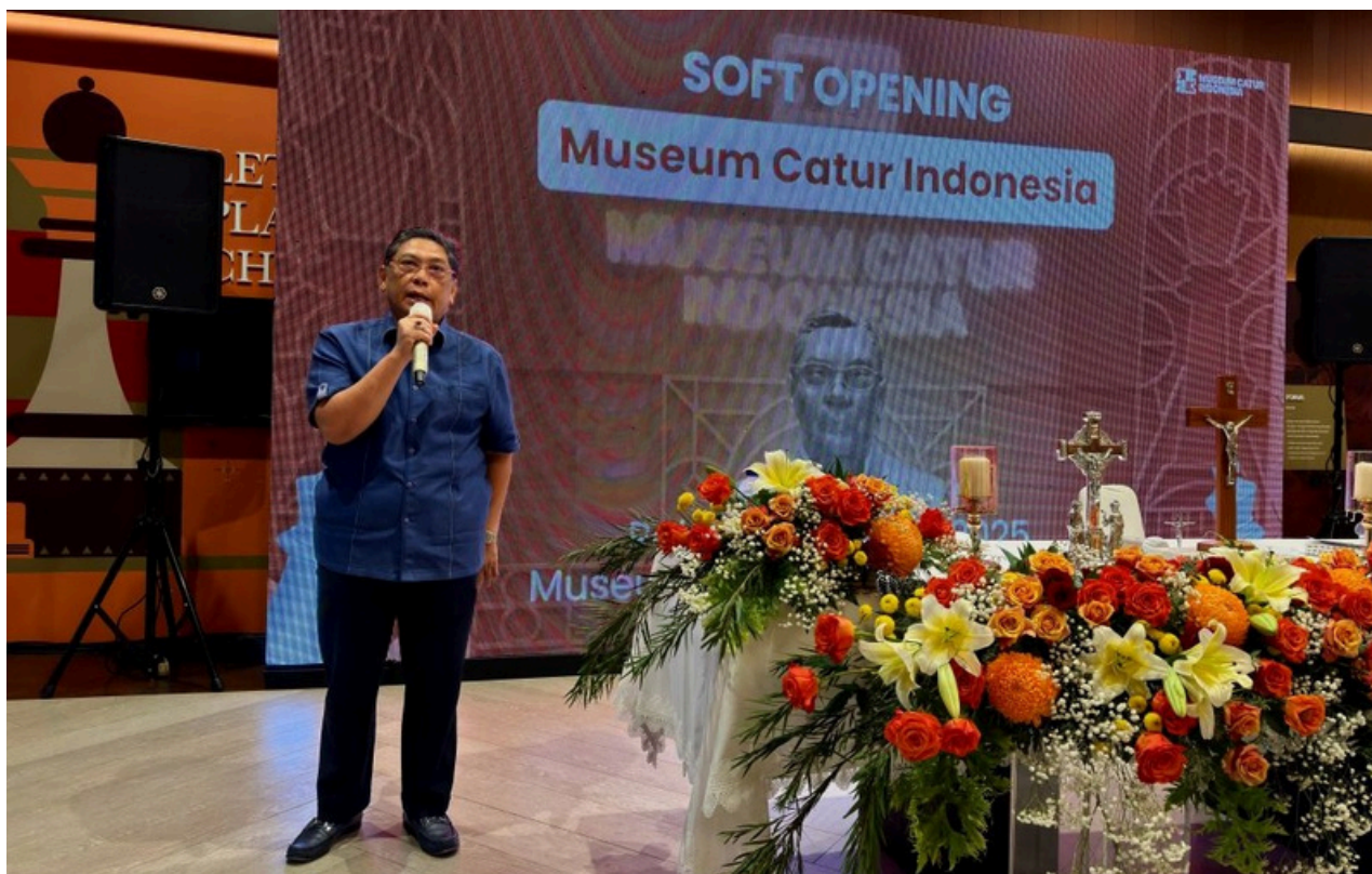
Indonesian Chess Federation president GM Utut Adianto opening the Indonesia Chess Museum.

There are few chess museums in various countries – Iceland, Netherlands, Russia, Switzerland, Türkiye and now in Indonesia. Museum Catur Indonesia (Indonesia Chess Museum) was soft launched on 26th February 2025. Who are the people who made it happen? Visit asianchess.com for Peter Long's information and attractive photos. It is located together with Cafe Tuter at the Headquarters of the Utut Adianto Chess School (SCUA) in Bekasi, Indonesia, a FIDE Tier 1 Academy also founded by Eka Putra Wirja. The soft launch of the Indonesia Chess Museum (ICM) on 26th February 2025 was indeed a celebration of family, friends, and colleagues of Eka Putra Wirja.