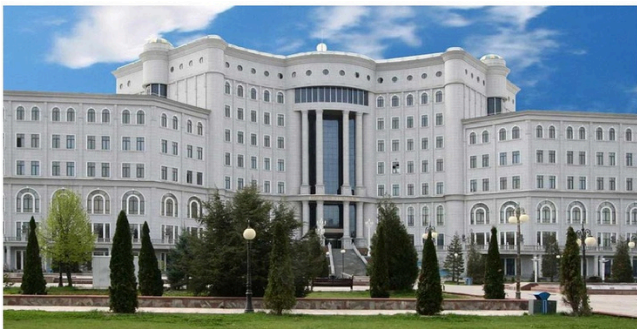
The Official Venue is the National Library of Tajikistan.