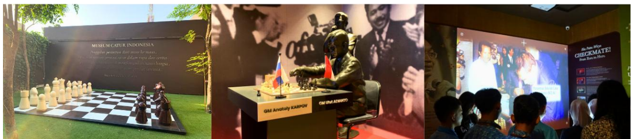
Indonesia Chess Museum